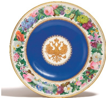
Lot 513: Popov Manufactory Large bowl with imperial double eagle and fine floral décor | Moscow | Mid-19th century | Ø 44.5 cm Result: €20,000