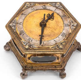
Lot 624: Jacob Gierke Large horizontal table clock | Dated 1649 | Fire-gilt brass, silver, etc. | 9.5 x 15.5 x 15.5 cm Result: €37,000