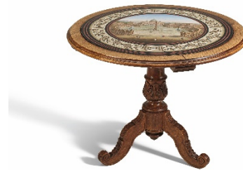
Lot 543: Micro mosaic tabletop with view of St. Peter's Square Vatican workshops | Rome | 1st half of the 19th cent. | Table: height 78 cm ø 100 cm Result: €22,500