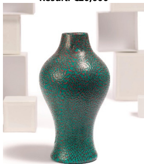
Lot 667: Vase with "A dama" décor Venini & C. Murano | Model 1953 | Colourless glass, fused murrine in opaque turquoise green and opaque red | Height 23 cm Result: €34,500