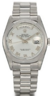
Lot 230: Rolex Day-Date | Ref. 18206 Platinum | Revision 01/2024 Result: €29,000