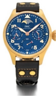
Lot 341: IWC Schaffhausen Big Pilot | Le Petit Prince Perpetual | Ref. 502802 Result: €31,500