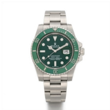
Lot 226: Rolex Submariner "Hulk" Ref. 116610LV | Full set Result: €16,000

The limited Big Pilot edition Le Petit Prince (lot 341) from the renowned Swiss watch brand IWC Schaffhausen came from a private collection in North Rhine-Westphalia. Its proceeds go to a good cause. The watch, which was inspired by Antoine de Saint-Exupéry's famous book The Little Prince , was acquired for a total of 31,500 euros by a live online bidder from Switzerland.