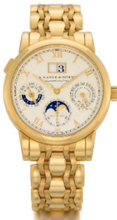
Lot 205: A. Lange & Söhne Langematik | Ref. 310.221E | Eternal calendar Result: €46,000

A number of top watches from various renowned brands on offer came from another eminent private collection. The highlights of the selection met with great interest: the Langematik (lot 205) from A. Lange & Söhne with the pinnacle of the watchmaker's art – an eternal calendar – was sold for 46,000 euros. The timeless Grand Complication (lot 212) from Patek Philippe earned 29,000 euros, while an IWC Grand Complication (lot 210) with a massive platinum case changed owners for 66,000 euros.