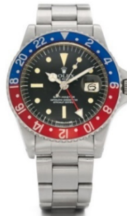
Lot 221: Rolex GMT II "Pepsi" Ref. 1675 | Radial dial Result: €22,500

The limited Big Pilot edition Le Petit Prince (lot 341) from the renowned Swiss watch brand IWC Schaffhausen came from a private collection in North Rhine-Westphalia. Its proceeds go to a good cause. The watch, which was inspired by Antoine de Saint-Exupéry's famous book The Little Prince , was acquired for a total of 31,500 euros by a live online bidder from Switzerland.