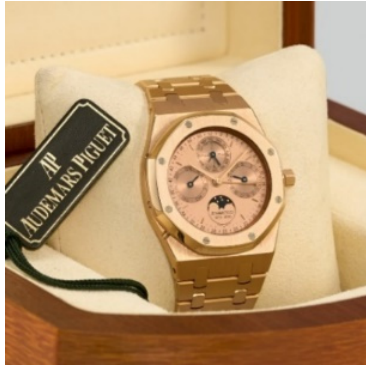
Lot 360: Audemars Piguet Royal Oak | Ref. 25810 | Eternal calendar Result: €145,000

a price of 16,000 euros. The GMT Master II (lot 221) with the two-colour bezel in blue and red – therefore also called Pepsi – earned a result of 22,500 euros, and the iconic Batman (lot 223) changed wrists for a total of about 13,000 euros.