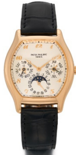
Lot 212: Patek Philippe Grand Complication | Ref. 5040R-016 Result: €29,000