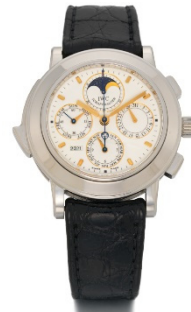
Lot 210: IWC Schaffhausen Grand Complication | Ref. 3770 Result: €66,000