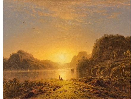
Lot 1165: Eduard Hildebrandt Sonnenuntergang am Pedra da Gavea bei Rio de Janeiro Around 1844 | Oil on canvas | 52 x 67 cm Result: €116,000 German auction record for this artist*