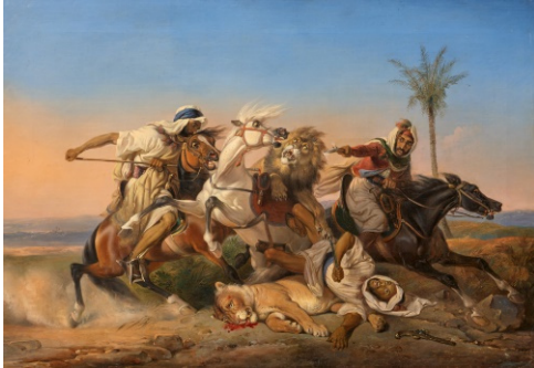
Lot 1159: Radén Saleh Ben Jaggia Battle between Arabian Horsemen and a Lion Oil on canvas | 67 x 98 cm Result: €726,000