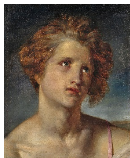
Lot 1092: Roman school (17th/18th century) Study of a young man's head | Oil on canvas | 44.5 x 38 cm Result: €14,500 Schleier Collection