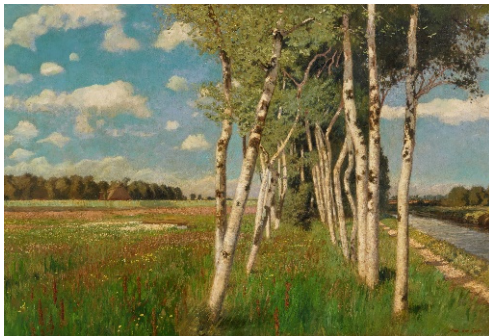
Lot 1200: Hans am Ende Bachlauf bei Worpswede | Oil on canvas | 137 x 202 cm Result: €72,500