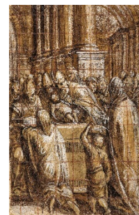
Lot 1004: Hans Mielich The Presentation of Christ at the Temple | Before 1572 | Black and brown chalk, heightened in white, squared on beige paper | 17 x 11 cm Result: €63,500 Int'l auction record for this artist*

All prices are rounded and include the buyer's premium.