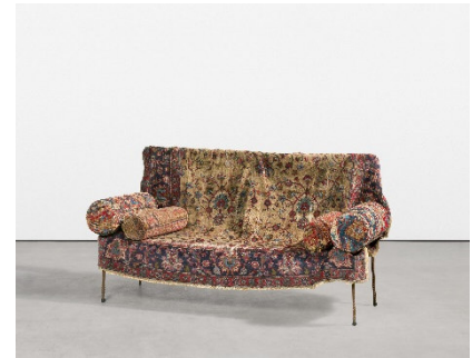
Franz West (1947–2012) Prototype of the auditorium divans | 1991 | Steel, foam, cardboard, carpet | 110 x 208 x 80 cm Result: €205,000