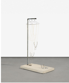
Claes Oldenburg (1929–2022) Ghost Wardrobe for M. M. | 4 parts | 1967–1983 Mixed media | C. 178 x 107 x 60 cm Result: €343,000