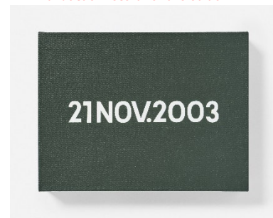
On Kawara (1932–2014) 21 NOV. 2003 | 2003 Acrylic on canvas | 20.5 x 26.5 cm Result: €290,000

Int'l auction record for a sculpture by this artist*