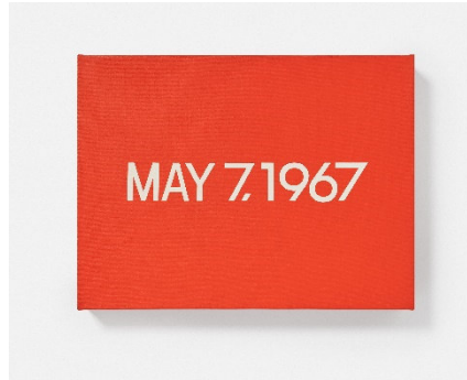
On Kawara (1932–2014) MAY 7, 1967 | 1967 Acrylic on canvas | 33.5 x 44 cm Result: €1,056,000 Int'l auction record for a date painting of this format*