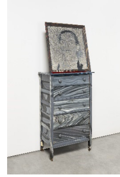
Richard Artschwager (1924–2013) Portrait I | 2 parts | 1962 Wooden chest of drawers and framed acrylic work Result: €211,000