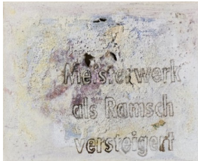
Sigmar Polke (1941–2010) Meisterwerk als Ramsch versteigert Mixed technique on canvas | 39.5 x 49.5 cm Result: €73,000