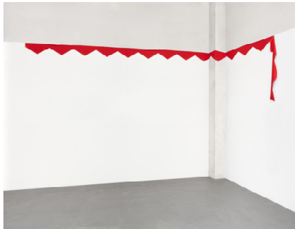
Thomas Schütte (b. 1954) Rote Girlande | 5 parts | 1979 Red fabric | Total: 30 x 4138 cm Result: €132,000