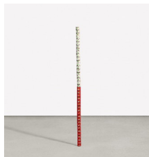
Thomas Demand (b. 1937) Untitled (Glückskleedosenturm) | 1969 | 40 milk tin cans | 179.5 x Ø 5 cm Result: €112,000

Int'l auction record for a sculpture by this artist*