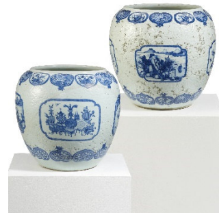
A pair of eminent cachepots with cut peony decoration China | Kangxi period (1662–1722) | Porcelain with white glaze and blue decoration | Height 50 cm, ø c. 53 cm Estimate: €30,000–40,000