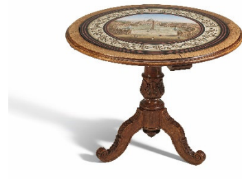
Micromosaic tabletop with view of St. Peter's Square Vatican workshops | Rome 1st half of the 19th cent. | Table: height 78 cm, ø 100 cm Estimate: €8,000–10,000