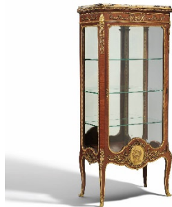
Magnificent display cabinet, Louis XVI style François Linke | Paris | Around 1895 | Kingwood | 149 x 62 x 36 cm Estimate: €9,000–11,000