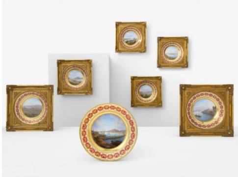
Set of twelve plates with romantic views of the Rhine KPM | Berlin | 1837–1844 Porcelain, decorated in colour and gold | Ø 24.5 cm each Estimate: €14,000–18,000