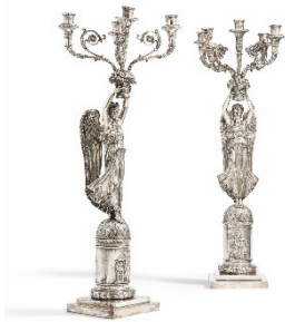
A pair of extraordinary girandoles with Victorias, Empire style Neresheim silver | Hanau | Around 1900 | C. 7670 g | Height 73.5 cm each Estimate: €15,000–20,000